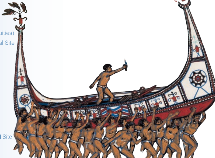
▲ Boat Launching Ceremony in Orchid Island H51.5 W65 cm / ROC