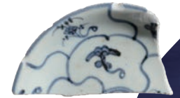
▶ Sherd of Blue and White Siagukeng Archaeological Site