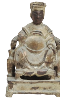
▶ Mazu W10 D8.5 H16.5 cm / ROC