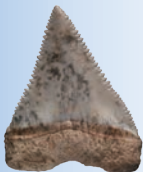
▲ Tooth of Shark National Shihsanhang Archaeological Site