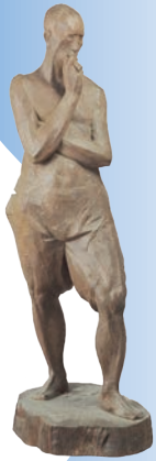
▲ Seaman H104 cm / ROC

As early peoples crossed the Taiwan Strait—called the “black trench” in their time—and came to cultivate barren lands, they spread their roots from the coastal regions inland. For four centuries, the great powers of Asia, Europe, and America all influenced Taiwan in different ways and at different periods. Like crashing waves launching spray along the shore, these cultures impacted far-reaching corners of the island, culminating in an unstoppable flow of history. Through regime changes and the coming together of peoples, the circumstances of history gave birth to a diversified maritime culture, seen in fishing, cuisine, villages, coastlines, navigation, seafaring vessels, maritime power, literature, art, customs, festivals, and more, all offering a rich illustration of maritime Taiwan.