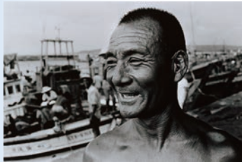
▲ Seaman H40.5 W50.5 cm / 1956

As early peoples crossed the Taiwan Strait—called the “black trench” in their time—and came to cultivate barren lands, they spread their roots from the coastal regions inland. For four centuries, the great powers of Asia, Europe, and America all influenced Taiwan in different ways and at different periods. Like crashing waves launching spray along the shore, these cultures impacted far-reaching corners of the island, culminating in an unstoppable flow of history. Through regime changes and the coming together of peoples, the circumstances of history gave birth to a diversified maritime culture, seen in fishing, cuisine, villages, coastlines, navigation, seafaring vessels, maritime power, literature, art, customs, festivals, and more, all offering a rich illustration of maritime Taiwan.