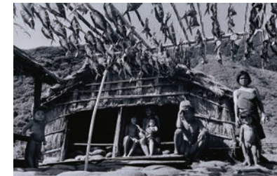
▲ Flying Fish Season H51 W61 cm / 1956

Hopefully through the diverse viewpoints offered by this exhibition, visitors will feel a closer affinity to the sea. By understanding and growing closer to our natural surroundings, we can come to cherish the rich resources and cultural heritage it provides and work together to protect our oceans.