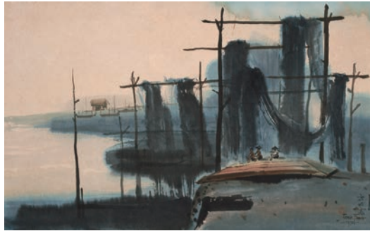
▲ Fishing Net H84.3 W51.7 cm / ROC

Its distinctive maritime culture sets Taiwan apart on the world stage. In this exhibition, people’s unique relationship with the ocean is traced through exhibits and research from the National Museum of History and the Shihsanhang Museum of Archaeology in New Taipei City. Diverse artworks and ancient artifacts alike call out to us using the vocabulary of the sea. Visitors can experience the birth of islands, the evolution of nature, and the unfolding of history through archeological findings such as fishing equipment. They can experience the roles and perspectives of art in a maritime society through photography, oil and ink wash painting, pottery, and wood carving. They can see the progression of Taiwanese history through a variety of perspectives.