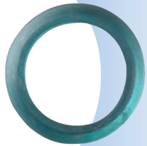
▲ Glass Bracelet (Significant Antiquities) National Shihsanhang Archaeological Site

Its distinctive maritime culture sets Taiwan apart on the world stage. In this exhibition, people’s unique relationship with the ocean is traced through exhibits and research from the National Museum of History and the Shihsanhang Museum of Archaeology in New Taipei City. Diverse artworks and ancient artifacts alike call out to us using the vocabulary of the sea. Visitors can experience the birth of islands, the evolution of nature, and the unfolding of history through archeological findings such as fishing equipment. They can experience the roles and perspectives of art in a maritime society through photography, oil and ink wash painting, pottery, and wood carving. They can see the progression of Taiwanese history through a variety of perspectives.